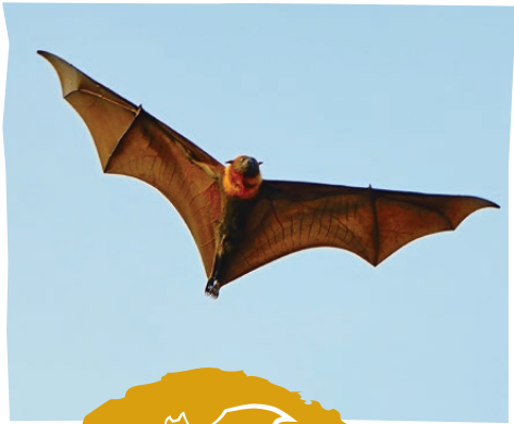
Namibia