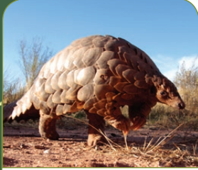
Namibia